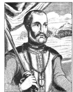
El Adelantado Don PEDRO de ALVARADO de Badojor.

The Pipil Indians, descendants of the Aztecs, likely migrated to the region in the 11th century. In 1528, Pedro de Alvarado, a Spanish lieutenant of Cortés, took over El Salvador and forced the native people to become servants. The forced intermixing and intermarriage by Spanish men with the Native American Indigenous Lenca and Pipil women happened almost immediately after the arrival of the European Spanish. The majority of Salvadorans in El Salvador identify themselves as 87% mestizo, leaving 12% white and ~1% indigenous Salvadoran population as a minority.